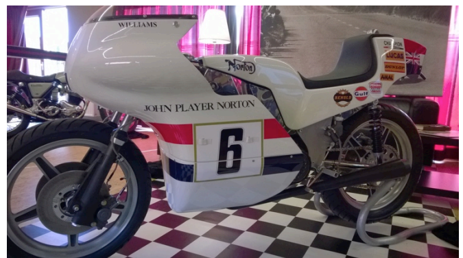
When is a replica the real thing?